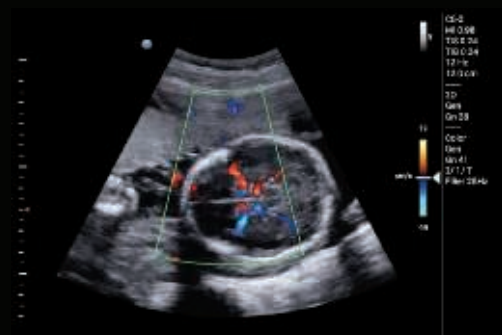
Middle cerebral artery