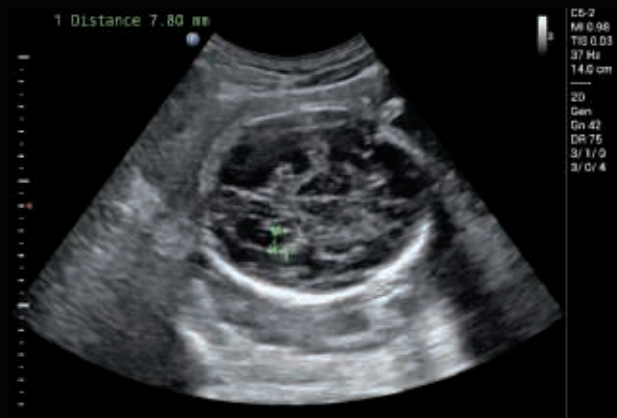
Easy-touch UI for quick measurements and calculations