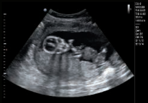
16-week fetal profile

InnoSight offers exceptional image quality across women's health care. Digital beamforming, THI, XRES, SonoCT, and automatic image optimization all help you obtain high-quality images.