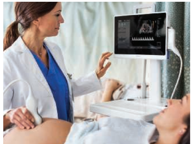
Quick scan for fetal well-being