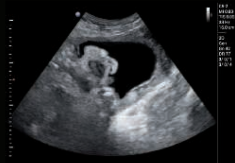
Fetal nose and lip