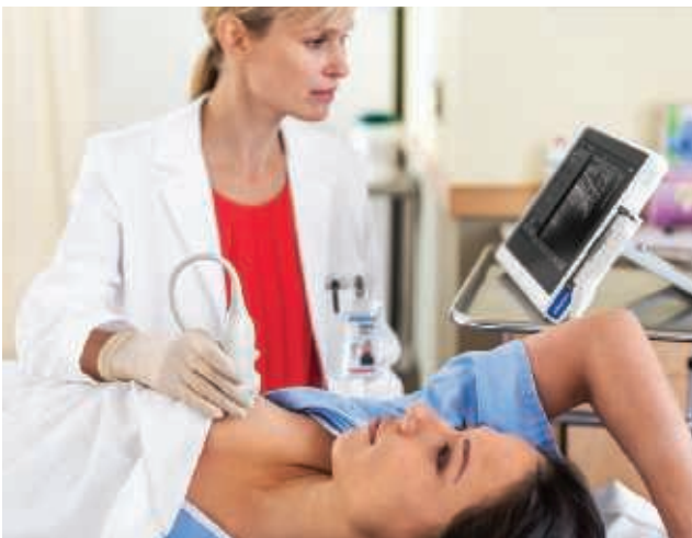
Complete women wellness applications

In the consult room. At the clinic. During labor and delivery. At bedside. In the community health center. No longer does your patient need to be sent to the ultrasound center for a scan. InnoSight lets you bring the confidence of ultrasound directly to your patient in more of the clinical environments you deliver care.